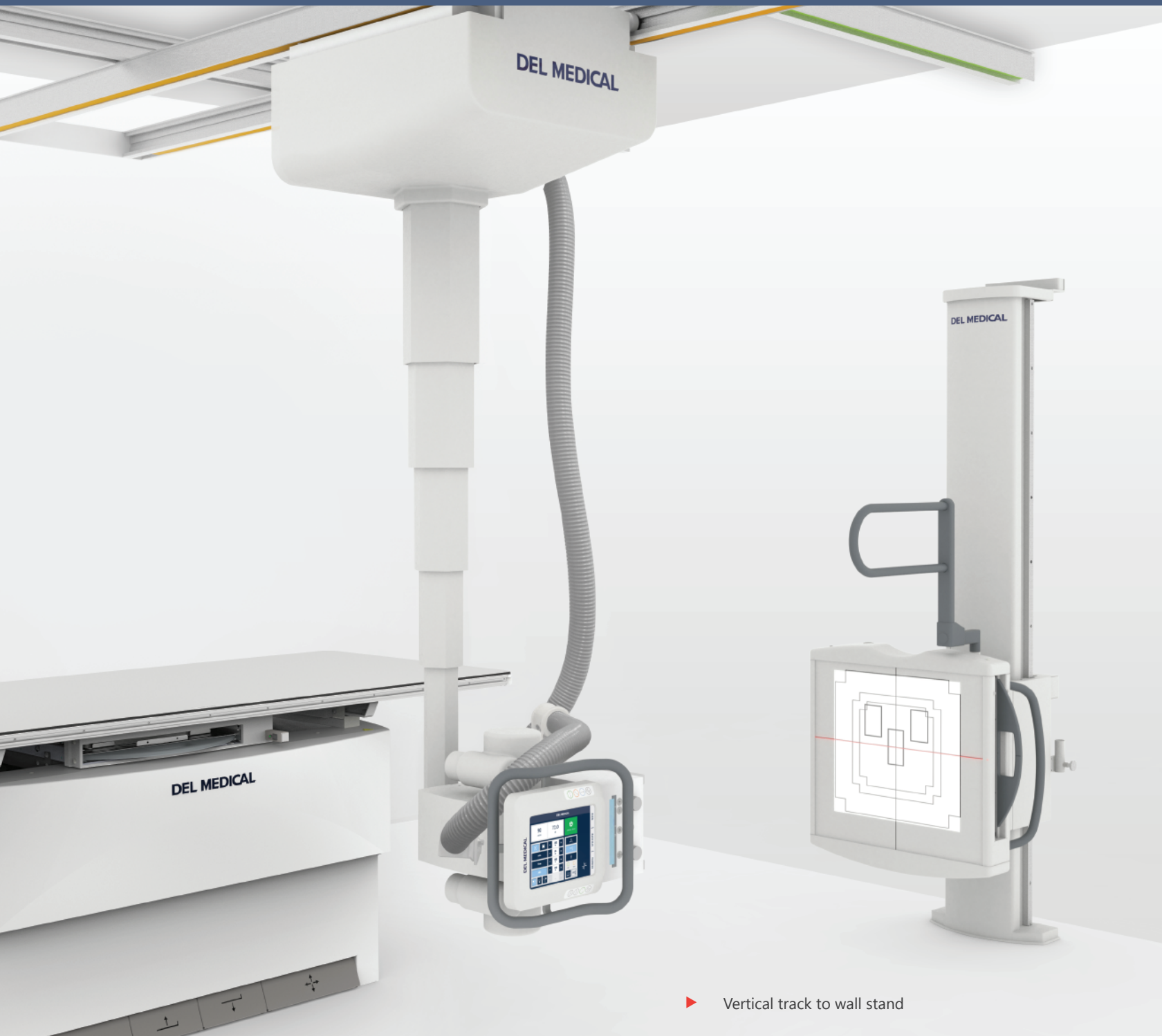
▶ Vertical track to wall stand