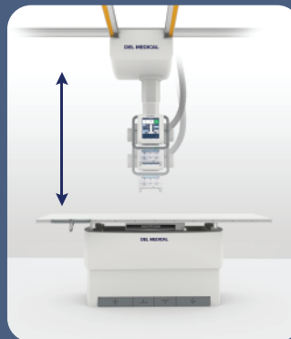
▶ SID track to table

Synchronized motorized movement of the tube crane's vertical axis maintains precise centering between the X-ray tube and image receptor. Available functions include vertical tracking to the wall stand, SID tracking to the elevating table, or horizontally positioned wall stand. The result is quick, accurate alignment without the extra time and effort needed to make additional manual adjustments.