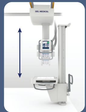
▶ SID track to wall stand